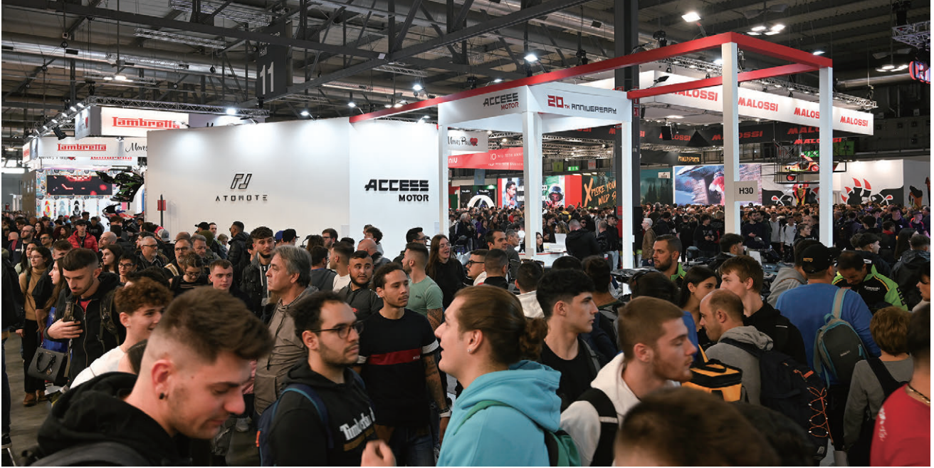
- 2024 EICMA Hall 11 Booth H30

with 2025 Line-Up and Debut of ATOMOTE Electric ATV Prototype